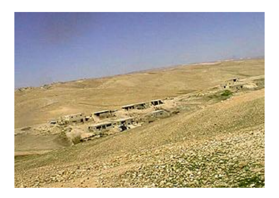
Al-Kaabneh : a small Palestinian settlement on the West Bank, 2000 people with no electricity, no telephones and no running water. About 10 miles southeast of Hebron, 15 miles from Masada, near the Dead Sea.

Selected, in a 1998 study by Friends of the Earth Middle East and the Palestinian Hydrology Council, as one of dozens of communities which are "off the grid" -- no conventional electricity, and ideal for participation in renewable solar energy programs.